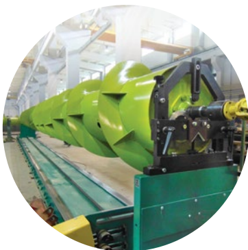
Header platform auger