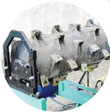
Feeder & discharge beater