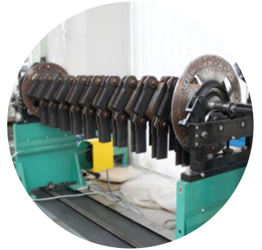
Straw knife drum