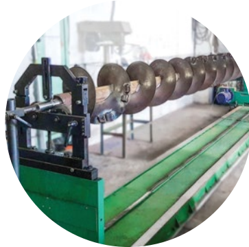
Augers different length