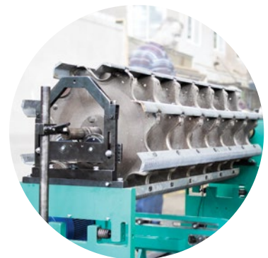
Threshing drum, Separation rotor